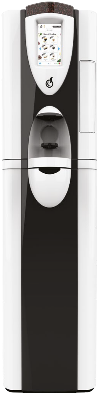
LEI SA RY TOUCH 7" + CABINET

Flavour and efficiency for high performance automatic service.